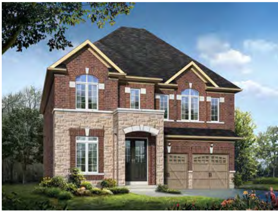
2688 SQ. FT. elev. b