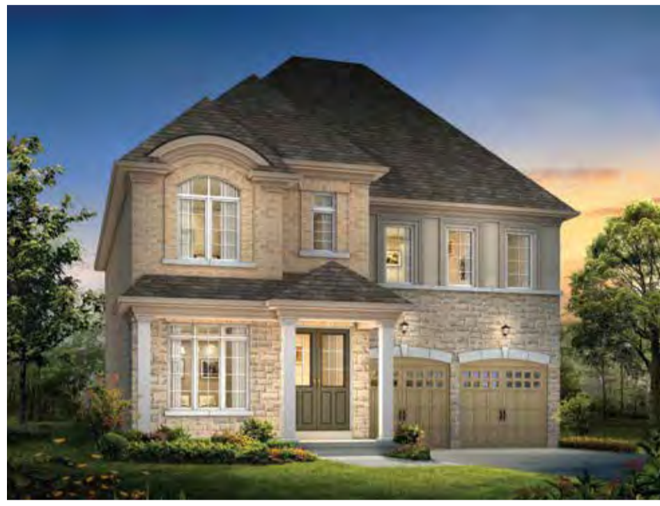
2688 SQ. FT. elev. c